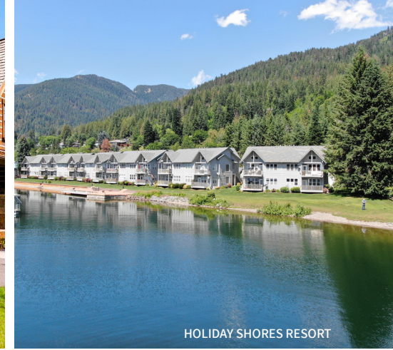
HOLIDAY SHORES RESORT