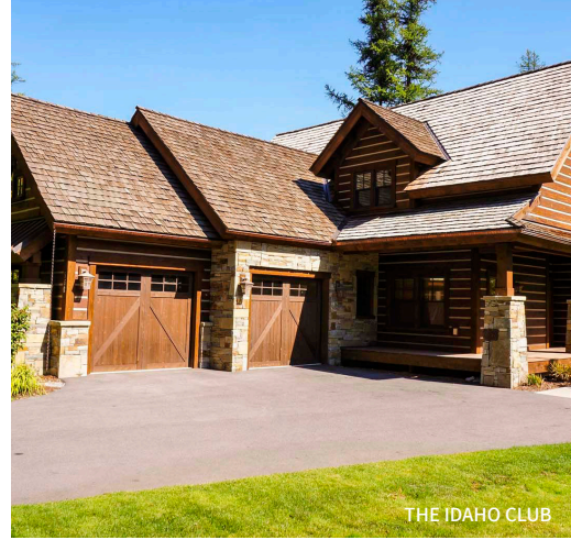
THE IDAHO CLUB