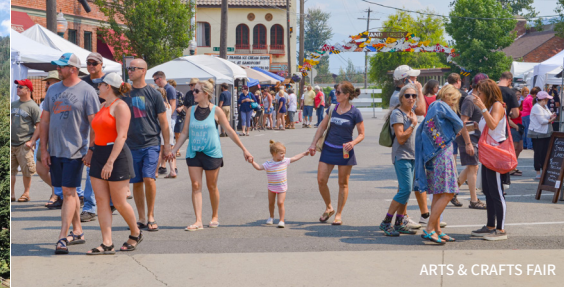
ARTS & CRAFTS FAIR