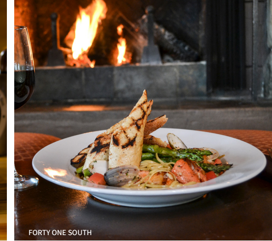
FORTY ONE SOUTH