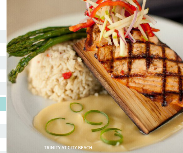
TRINITY AT CITY BEACH