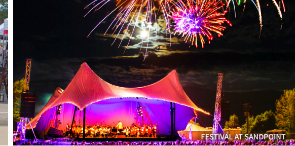
FESTIVAL AT SANDPOINT

RESTAURANT/CATERING LODGING MEETING ROOM MAX CAPACITY